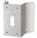
WV-Q183 Mount Bracket