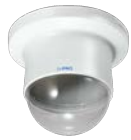
WV-QCD100C-W Dome Cover