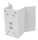
PACA4W Corner Mount Adapter Bracket