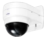
WV-QWD100C-W Wall Mount Bracket