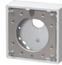
WV-QJB500-W Mount Bracket