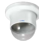
WV-QCD100C-W Dome Cover