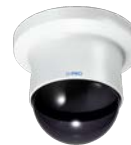
WV-QCD100G-W Dome Cover