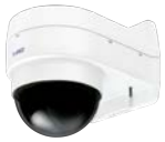
WV-QWD100G-W Wall Mount Bracket