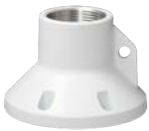
WV-QCL101-W Mount Bracket